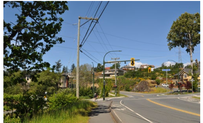
Burnside Road and Watkiss Way Intersection