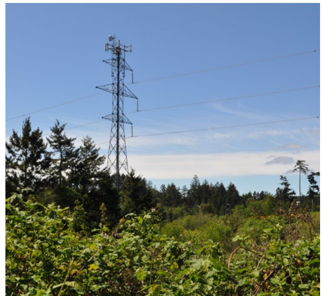
BC Hydro Transmission Tower