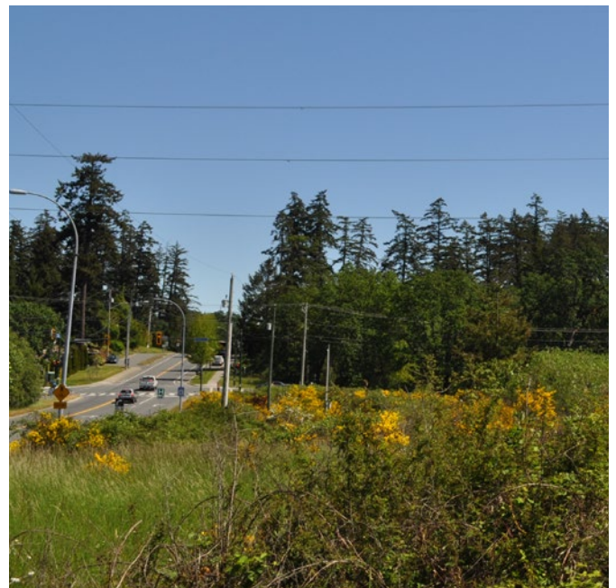
Highway Exit 10