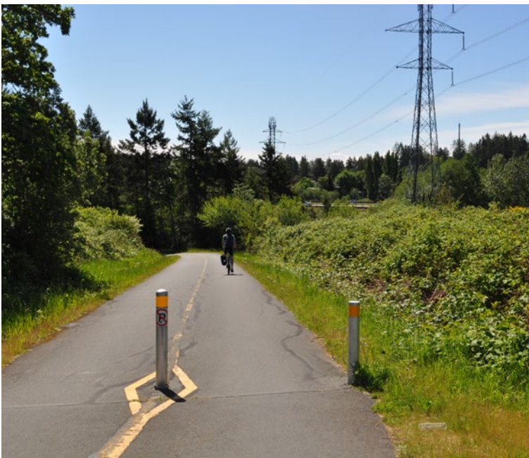
Galloping Goose Regional Trail

Design a site that supports expansion of a sustainable, fully electric handyDART service that improves access to transit for people with permanent or temporary disabilities that prevent them from using fixed-route transit without assistance from another person.